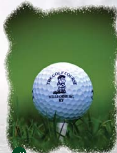
16 The Golf Course (606) 549-4215