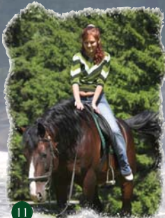
11 Bill's Riding Stables (606) 528-2066