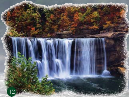
12 Cumberland Falls State Resort Park (800) 325-0063