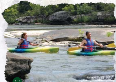
13 Canoeing the Cumberland