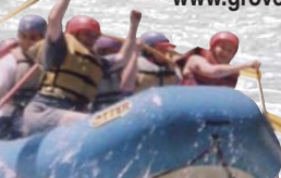
17 Sheltolee Trace Outfitters www.ky-rafting.com