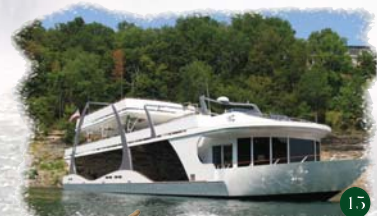
15 Grove Marina www.grovemarina.com