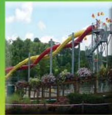
Kentucky Splash Water Park