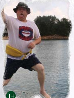
14 Laurel River Lake and Recreation Area